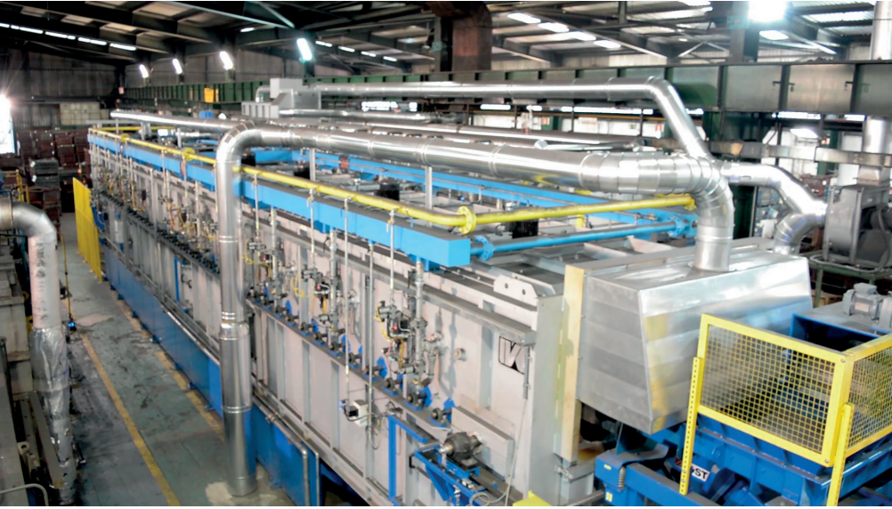
Example of continuous solution with casted belt for production up to 3000kg/h

The industry market and the final consumers are more and more attentive to the results of the heat treatment of the treated components. This is why our experience combined with the continuous research and the great flexibility of our furnaces, allows us to satisfy completely the customer's requests. Also for the forged pieces the heat treatment is very important. The heat treatment process guarantees the product structural uniformity and mechanical characteristics. The procedures at this stage are particularly accurate to ensure the best quality.